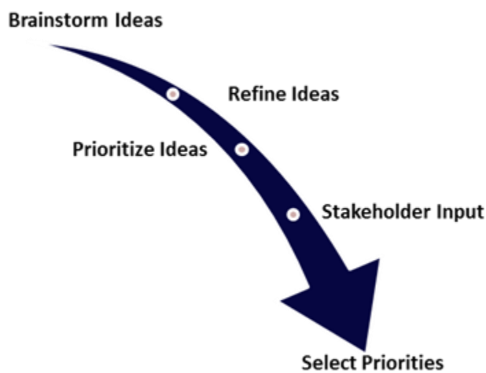
Figure 3. Framework for ICDR Strategic Plan